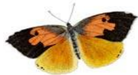
CALIFORNIA DOG-FACE BUTTERFLY State Insect