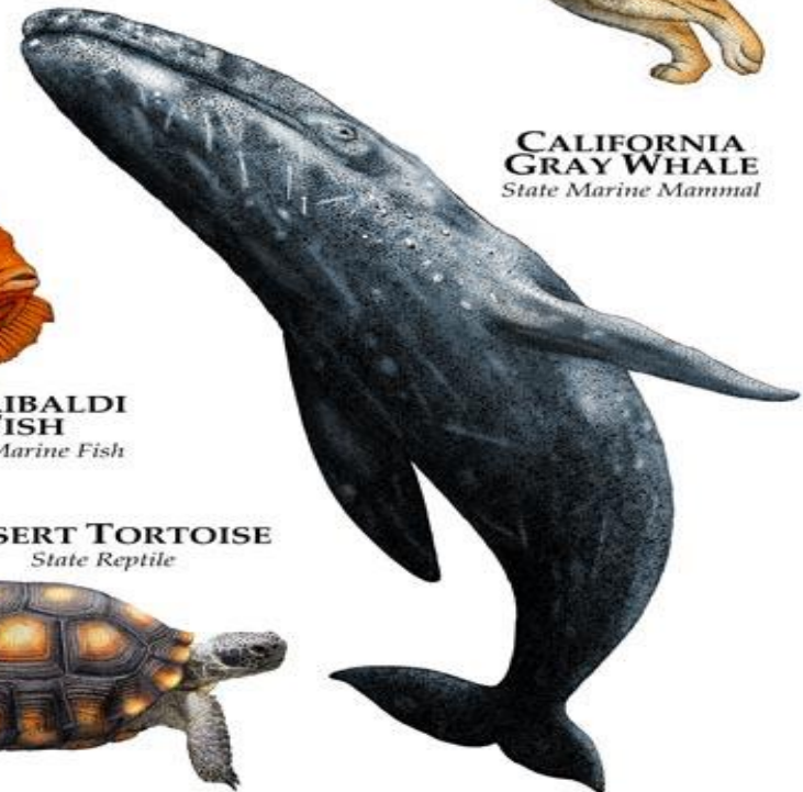
CALIFORNIA GRAY WHALE State Marine Mammal