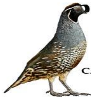
CALIFORNIA QUAIL State Bird