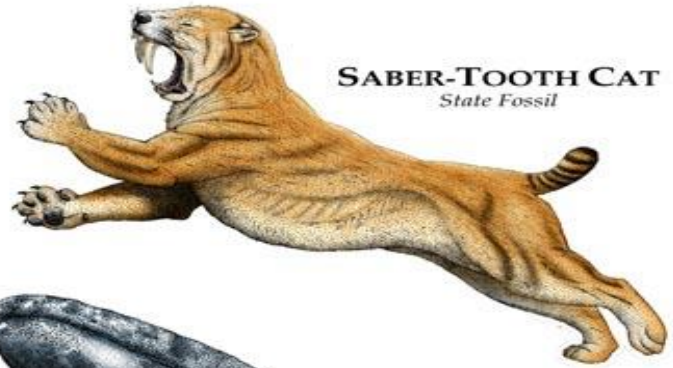
SABER-TOOTH CAT State Fossil