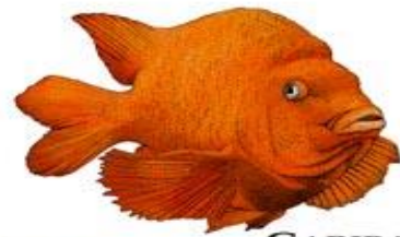
GARIBALDI FISH State Marine Fish