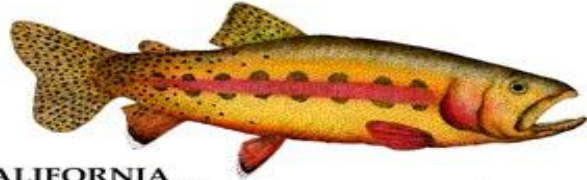
CALIFORNIA GOLDEN TROUT State Fish