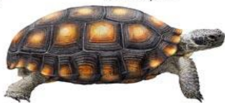
DESERT TORTOISE State Reptile