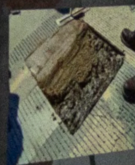
Bridge Deck Concrete Patching