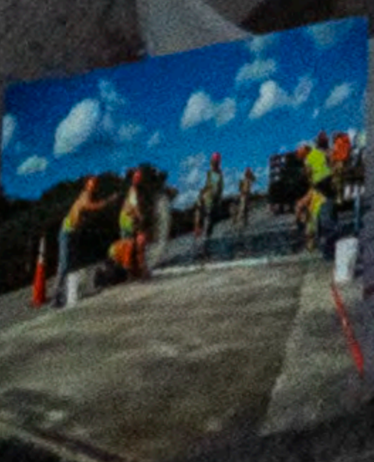
Bridge/Roadway Overlay & Rut Fills