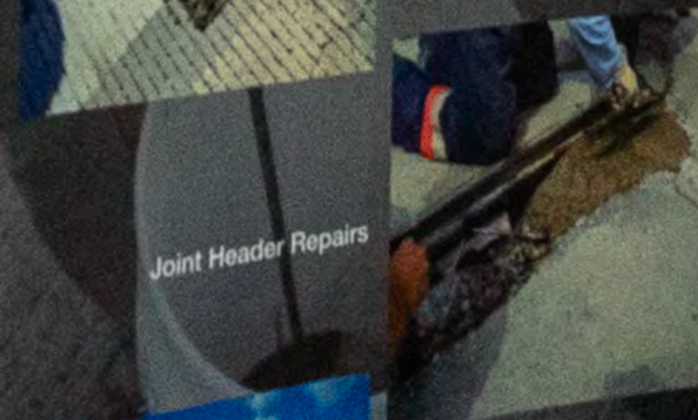
Joint Header Repairs